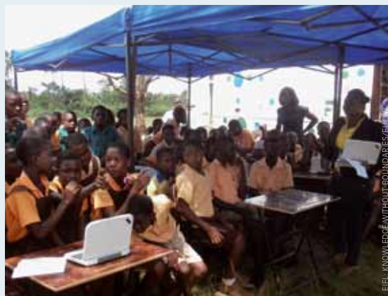
EFL: KNOWLEDGE WITHOUT BOUNDARIES/FILM

53 % of Papua New Guineans who access radio do so on mobile phones. Households there have more access to mobile phones than radios. http://goo.gl/G9vw9